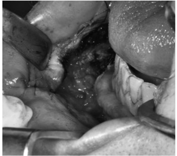
Fig.2 Full debridement of the necrotic tissue over the lower anterior vestibule under general anesthesia (the second surgery).