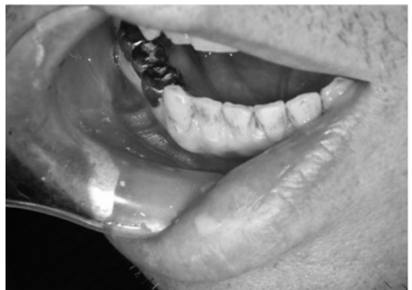
Fig.4 Complete wound healing 10 weeks after surgery.